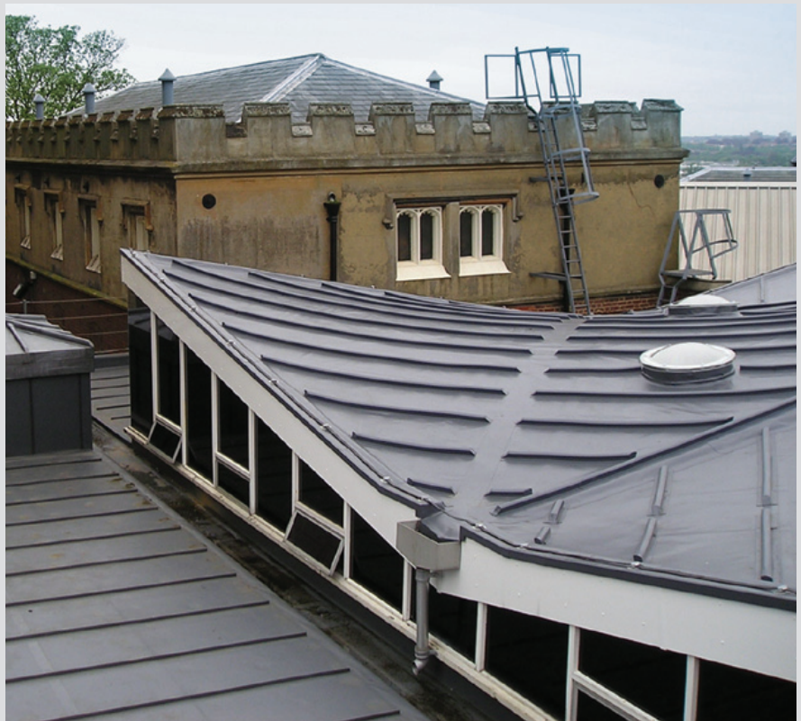
Is it lead or isn't it? Sarnafil Batten Profile creates the look of a traditional lead roof