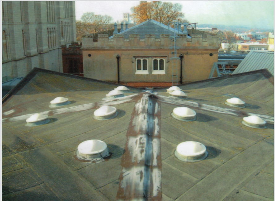
The roof before refurbishment

As with all Sarnafil Roof Management projects, comprehensive documentation was provided, outlining or recommendations. Sarnafil Roof Management survey reports include re-roofing specification, project specific CAD drawings and wind load calculations.